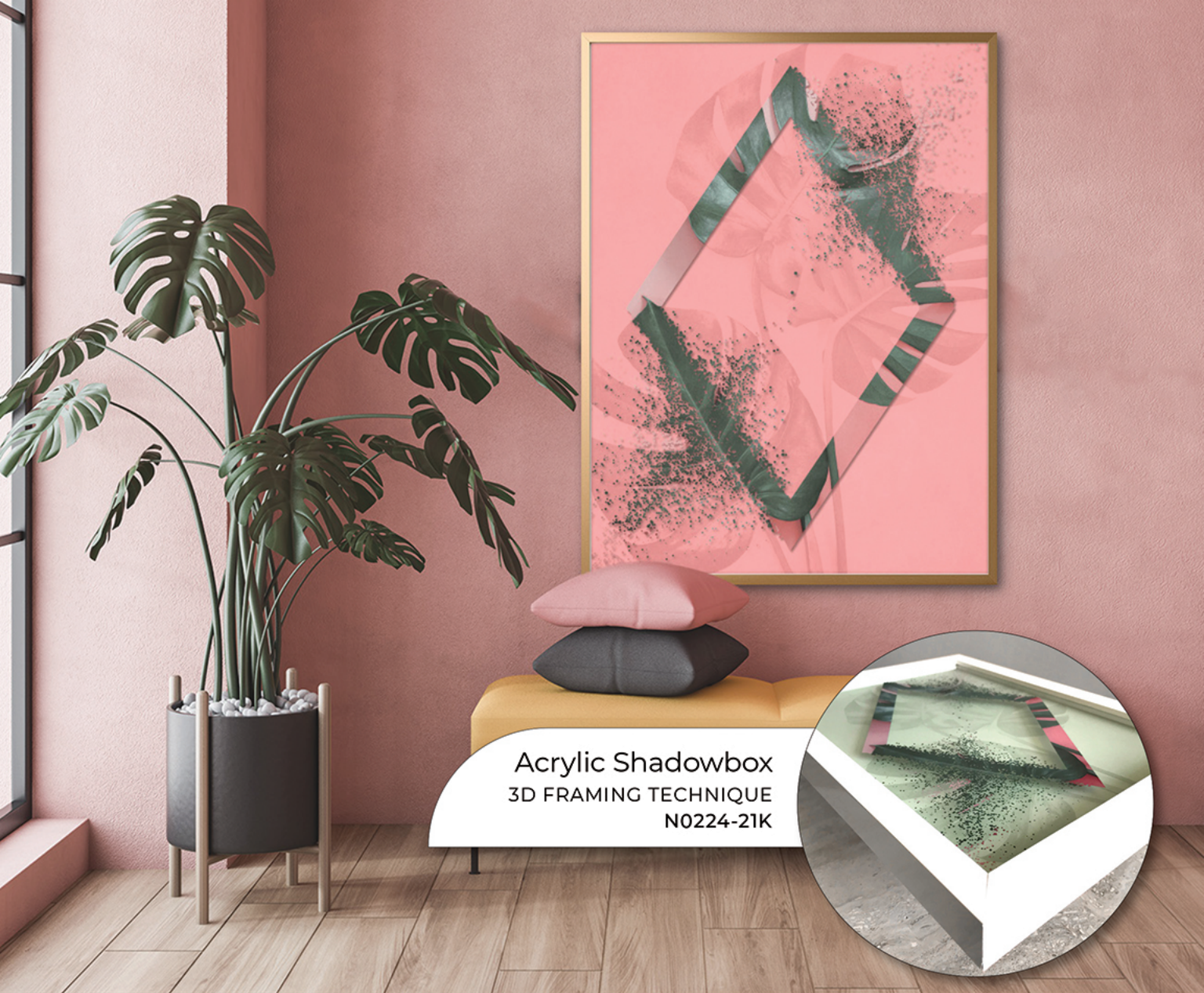
Acrylic Shadowbox 3D FRAMING TECHNIQUE N0224-21K