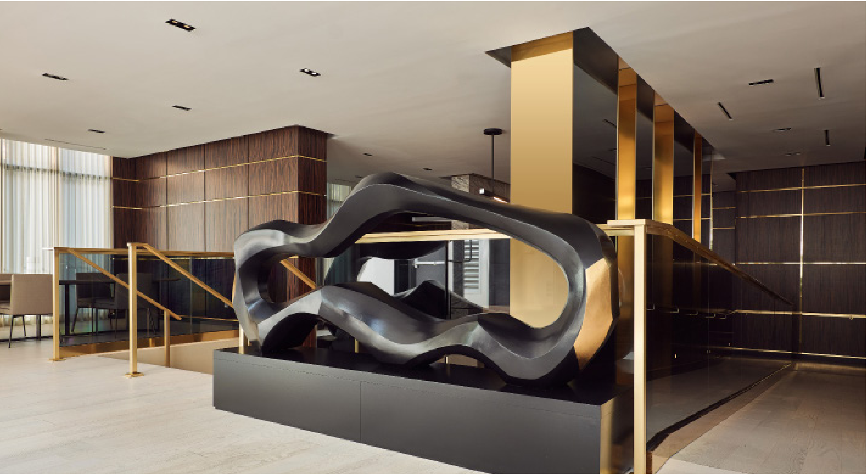
3 0 1 8 Y O N G E | B L A C K E N E D F I B R E G L A S S S C U L P T U R E | L O B B Y B A R