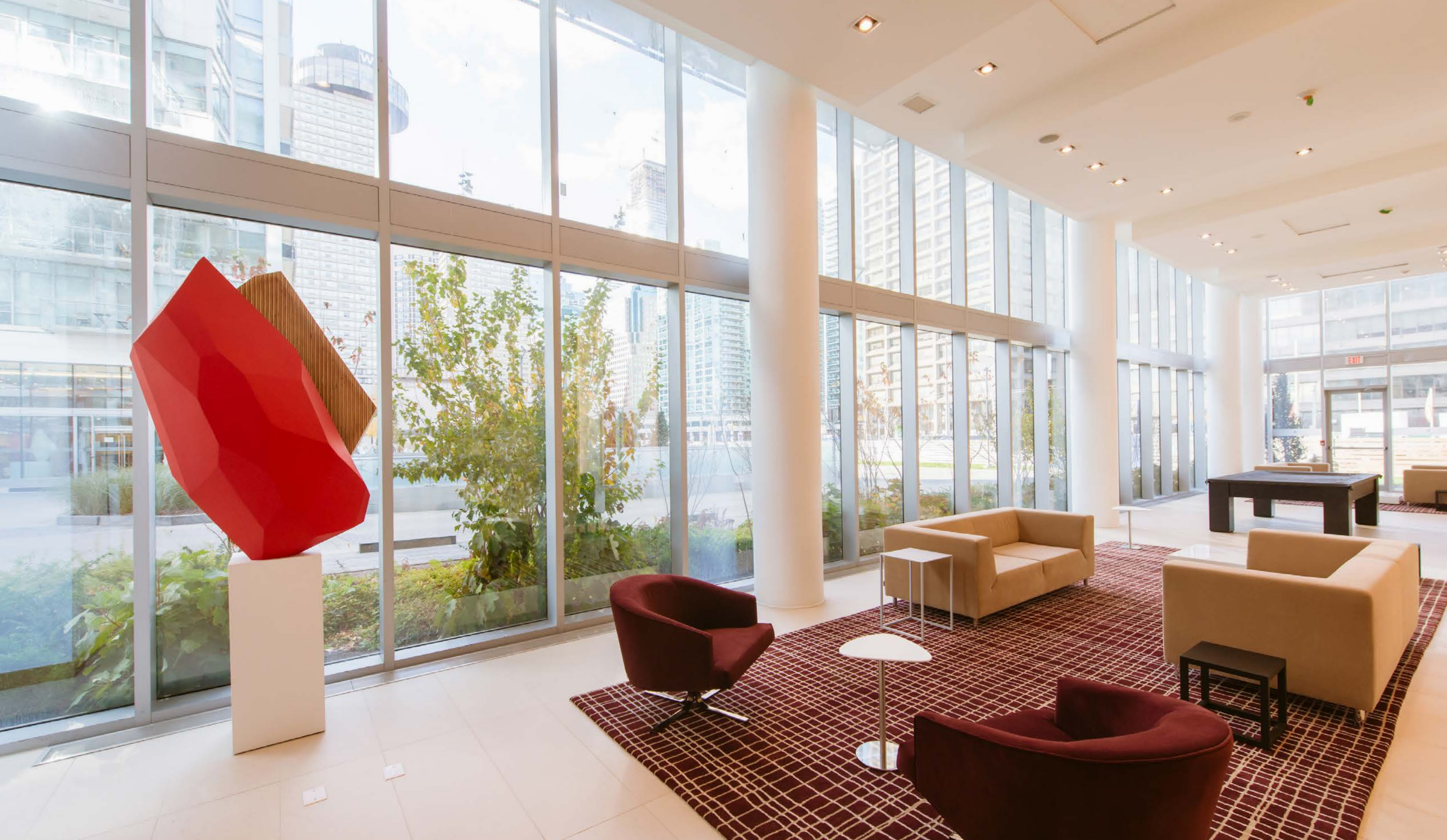
PIER 27 CARDINAL RED SHAPED STACKED WOOD | LOUNGE