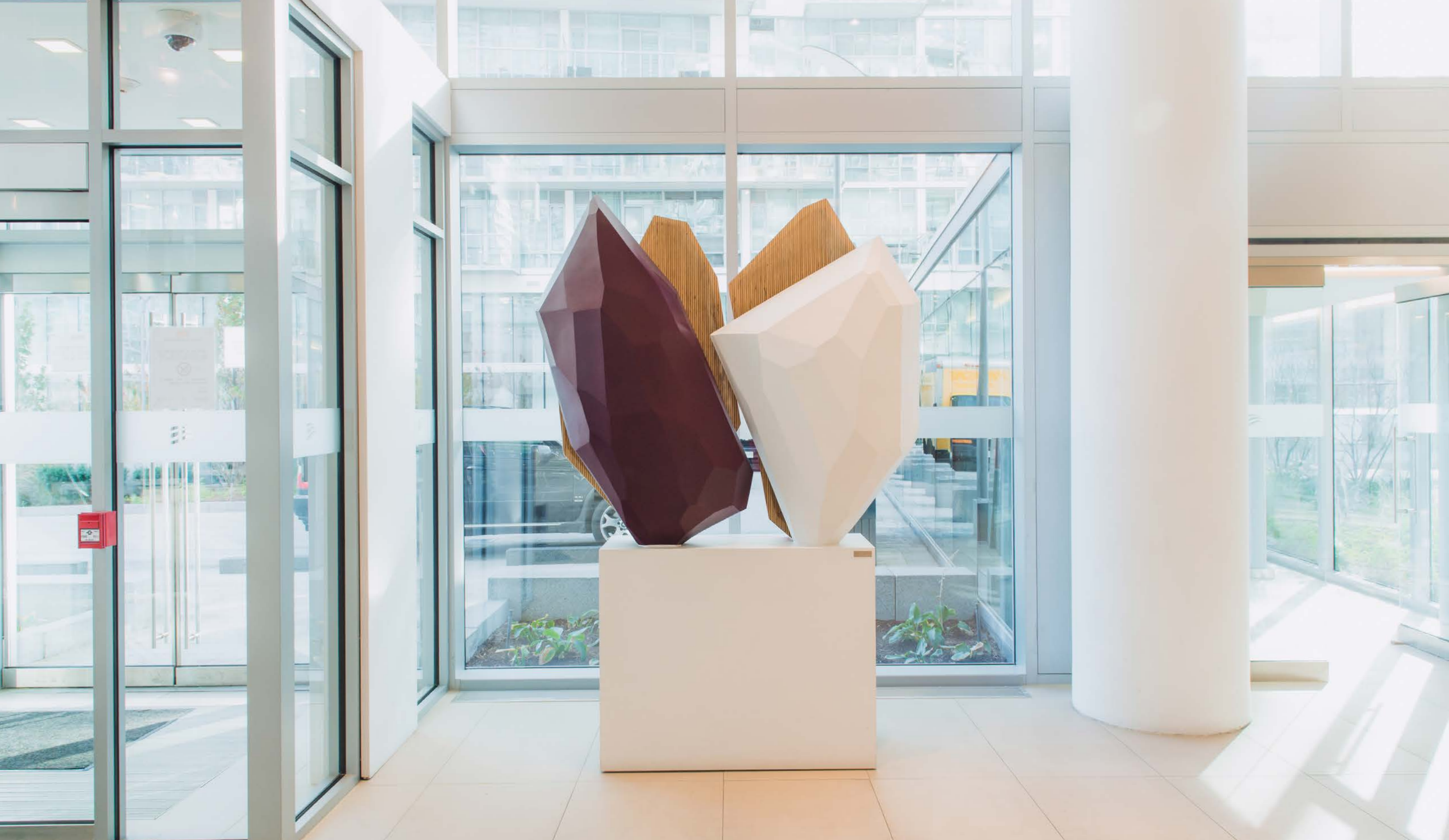
PIER 27 RAISIN & WHITE SHAPED STACKED PLYWOOD | CLUB LOUNGE