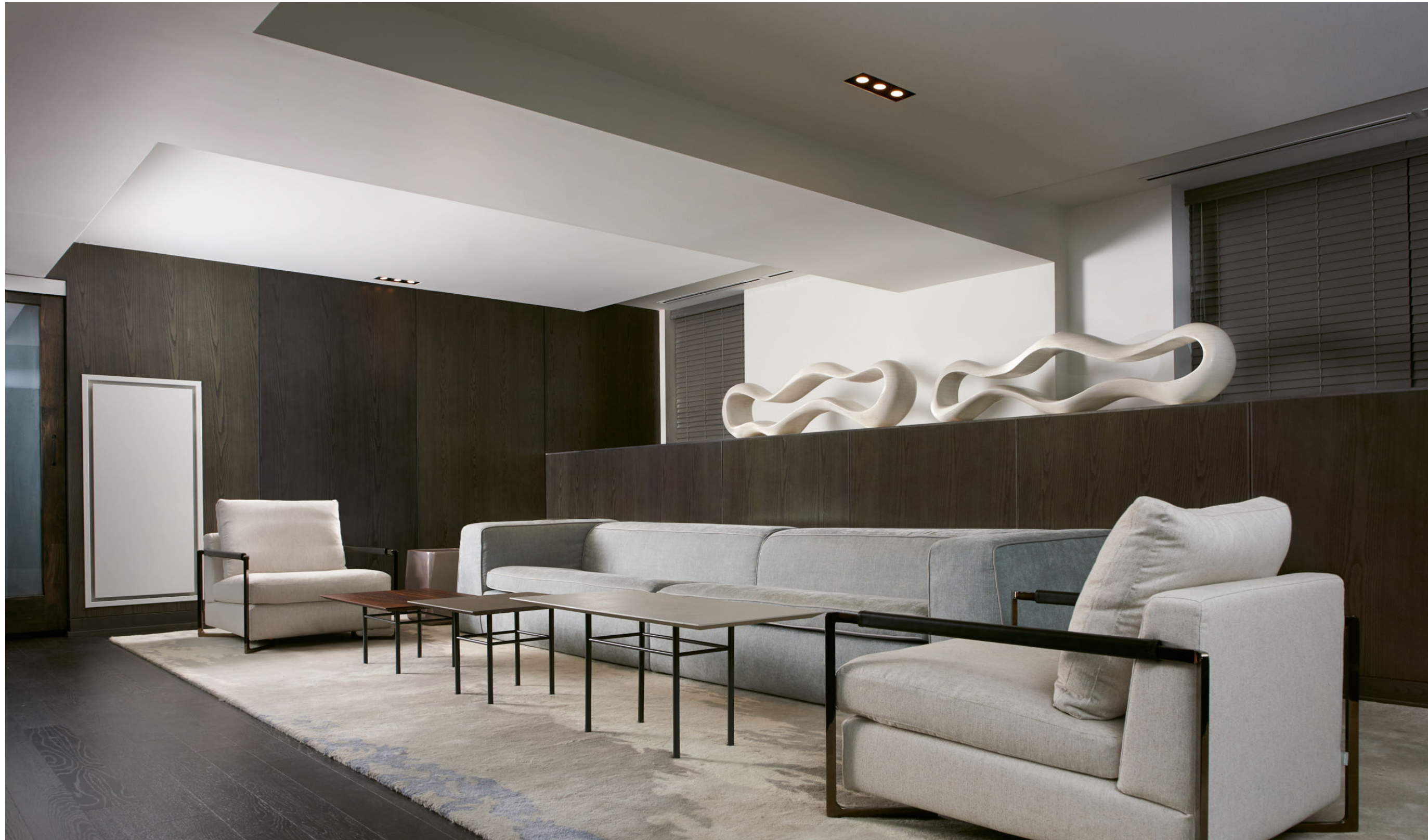
15 BEVERLY | WHITE WASHED POLISHED WOOD | MAIN LOBBY